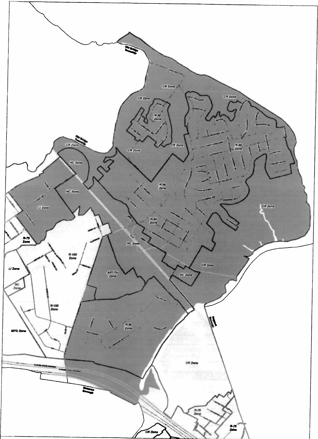
Figure 1: Area in Need of Rehabilitation Township of Aberdeen, Monmouth County, New Jersey

T&M Associates 11 Tindell Road Middletown, NJ 07746-2792 Phone: 732-671-6400 Fax: 732-671-7366